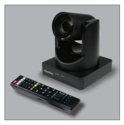
Multiple Control Options Simple USB 3.0/2.0 compatibility with UVC and UAC protocols support.