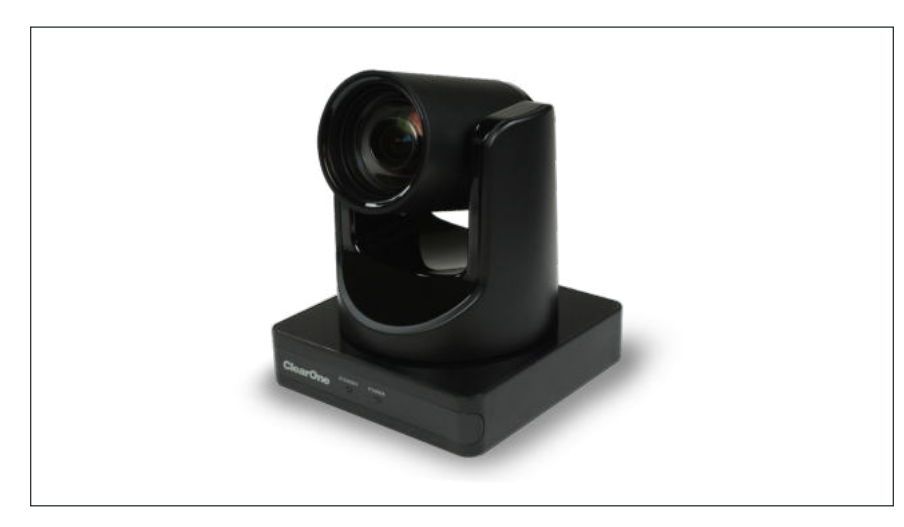
Professional grade 4K USB PTZ camera for conference rooms, web conferencing UC applications and more.