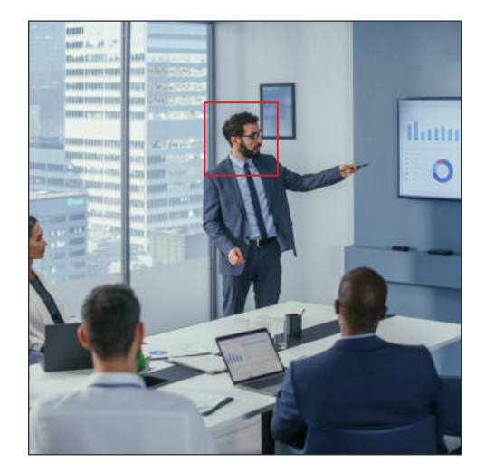
Smart Face Tracking or Auto Framing Al processing optionally tracks an individual or frames an entire group for perfect framing and focus.